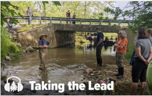
Taking the Lead

As the Lancaster Watershed Leadership Academy prepares to welcome a new class, we speak with recent graduates and Lancaster Clean Water Partners staff about the year-long training and networking program.