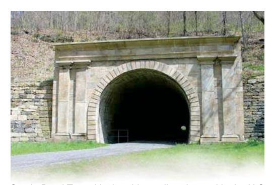
Staple Bend Tunnel is the oldest railroad tunnel in the U.S. and is a National Historic Landmark. It is part of the trail, maintained by the National Park Service.

The Path of the Flood is a cooperative effort of the following organizations: