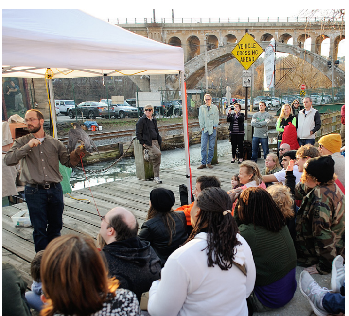
Schuylkill River Town event on the Manayunk Towpath

Between 1980 and the present day, the revitalization of Manayunk's economy shifted the historical working class demographics of the neighborhood. According to a gentrification map by Governing Magazine, since 1990 housing prices have increased by 109% and the number of residents holding bachelor's degrees has increased by almost 20%<sup>13</sup>. Manayunk's story reflects a planning strategy designed not for current community members, but rather for newcomers attracted by new development and recreational amenities. While the "greening of Manayunk" was positive for the economy and for the environment, the negative externality of displacement directly impacted the community. As affordability shifted, tension grew between the working class in the neighborhood and the new residents moving in to enjoy the amenities. The new businesses