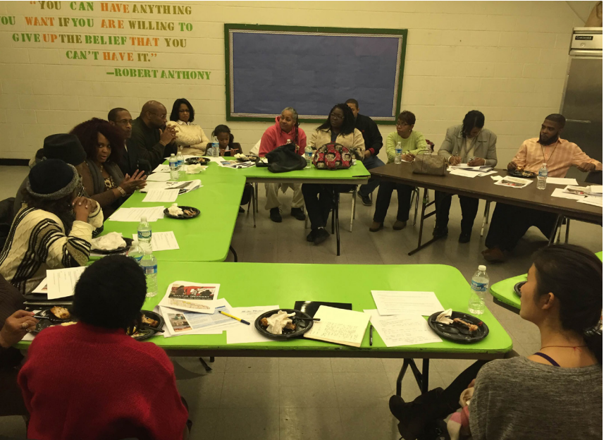
Mantua Greenway Resident Advisory Committee January 2016 Meeting

During the focus groups, community members lamented the state of Mantua Avenue as an unsafe environment characterized by abandonment and distress. Participants discussed how the walkway improvements made in the 2000s between 31st and 34th streets were an important start, but insufficient to make Mantua Avenue a desirable place to walk. Through these conversations, the Mantua Avenue Revitalization Initiative began, focusing on a comprehensive set of improvements to enhance and expand the existing greenway along Mantua Avenue through the redevelopment of vacant properties. The project aims to use public and private land for both new housing and active recreation. With these improvements, residents and project partners envision Mantua Avenue as the "neighborhood's front yard<sup>14</sup>."