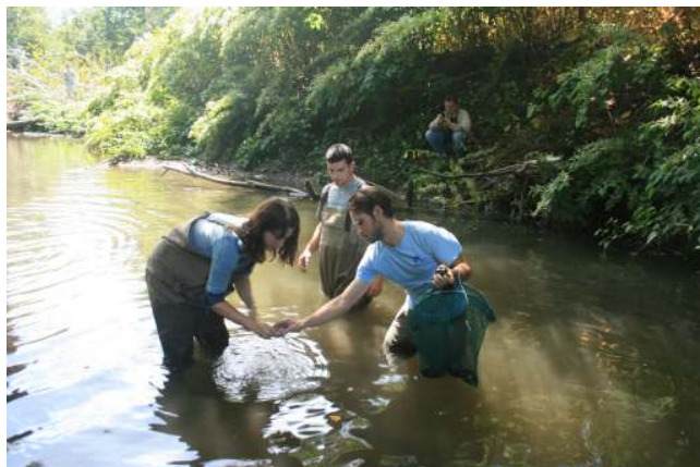
Mussel seeding in the Tacony Creek.

Mussel surveying and seeding has been taking place around the Delaware Watershed including within the Tookany/Tacony-Frankford Watershed in Philadelphia. Staff from the TTF Partnership participated in mussel seeding activities within the Tacony Creek on August 29th. This effort is part of a larger mussel initiative regionally coordinated by the Partnership for the Delaware Estuary. Find out more here.