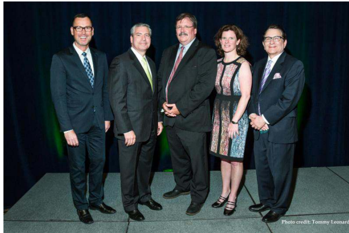
The 46th annual Philadelphia Environmental Partnership Dinner brought together key environmental stakeholders and decision-makers and over 300 representatives of business, industry, government, and the non-profit sector for what has become the biggest environmental event of the year in Philadelphia.